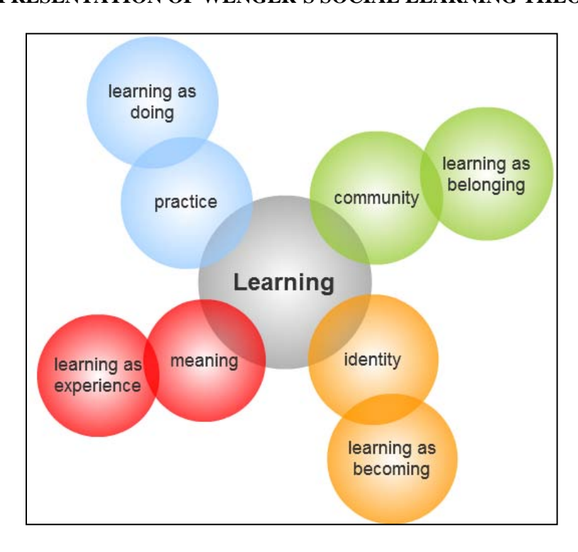
FIGURE 1 REPRESENTATION OF WENGER'S SOCIAL LEARNING THEORY

holistic body of social learning as interconnected. As referenced in Figure 1, the social theory of learning expresses multiple points of interaction between learning and the environment.