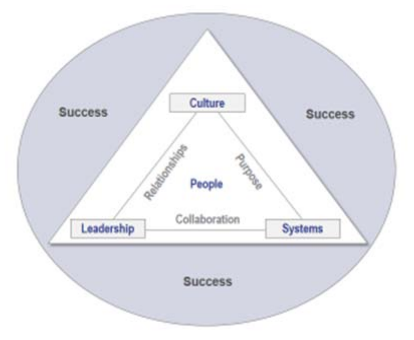
FIGURE 2 THE PERFORMANCE TRIANGLE – FOR OPTIMAL PERFORMANCE