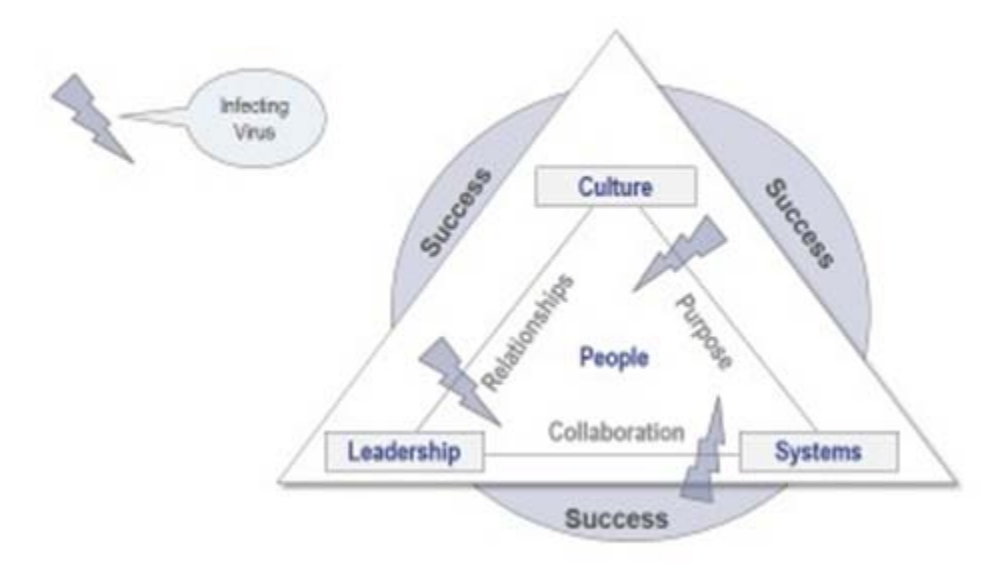
FIGURE 3 THE PERFORMANCE TRIANGLE WITH VIRUSES