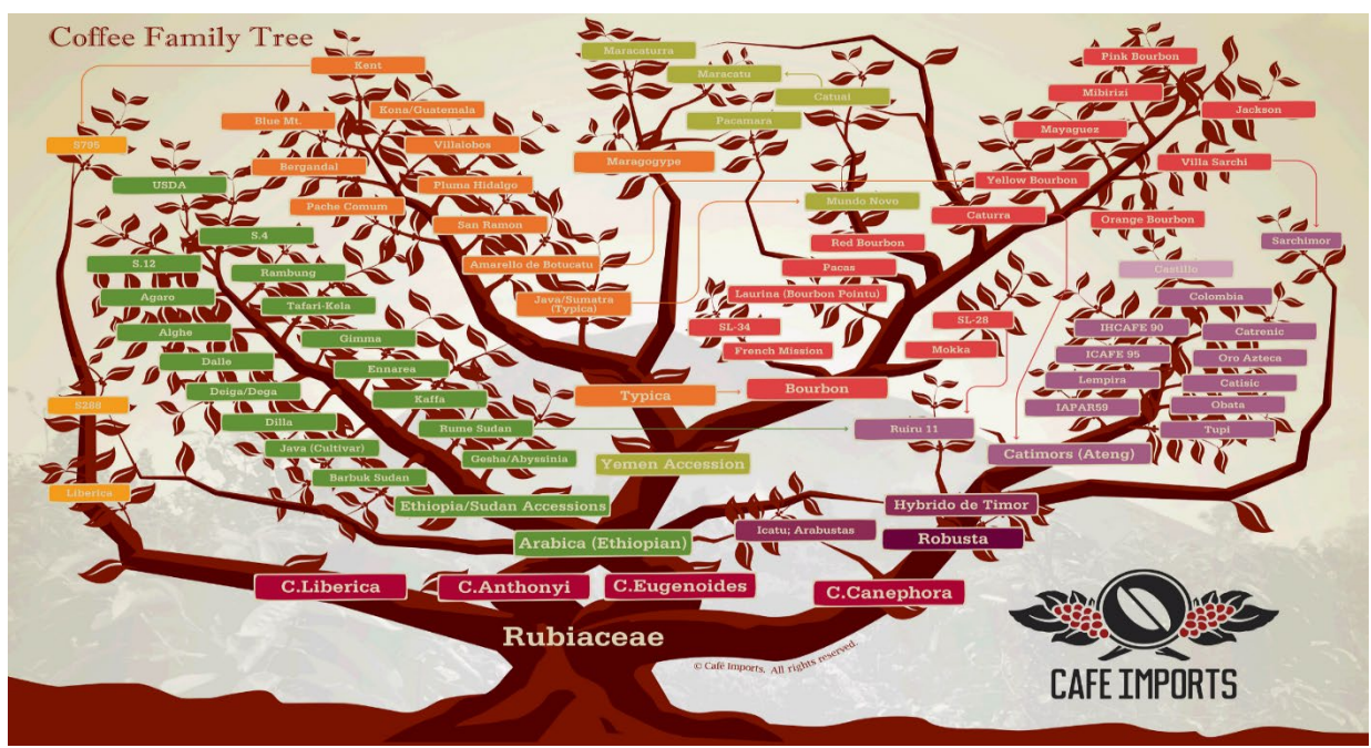
FIGURE 6 THE COFFEE FAMILY TREE