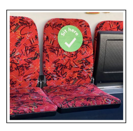
FIGURE 4 EXAMPLE OF AN INCLUSIVE VISUAL QUE IN NEW SOUTH WALES, AUSTRALIA

Aside from the visible text<sup>4</sup> that explicitly states that you can 'sit here', two additional elements seem to further reinforce the visual cue's message—the color and the symbol. Color green is universally understood to mean 'go' (e.g., Traffic lights) and the 'check' symbol is often used to validate a correct action. Several studies support the idea that a human mind has a tendency to associate meaning to colors and symbols (Elliot & Maier, 2014; Yoon & Vargas, 2018). Figure 5 shows a proposed symbol color and symbol heuristics for visual cues. Visual cues that are designed to complement human cognitive biases are more inclusive because they can also cater to special types of public commuters—such as people with disabilities (PWD), illiterate, and kids.