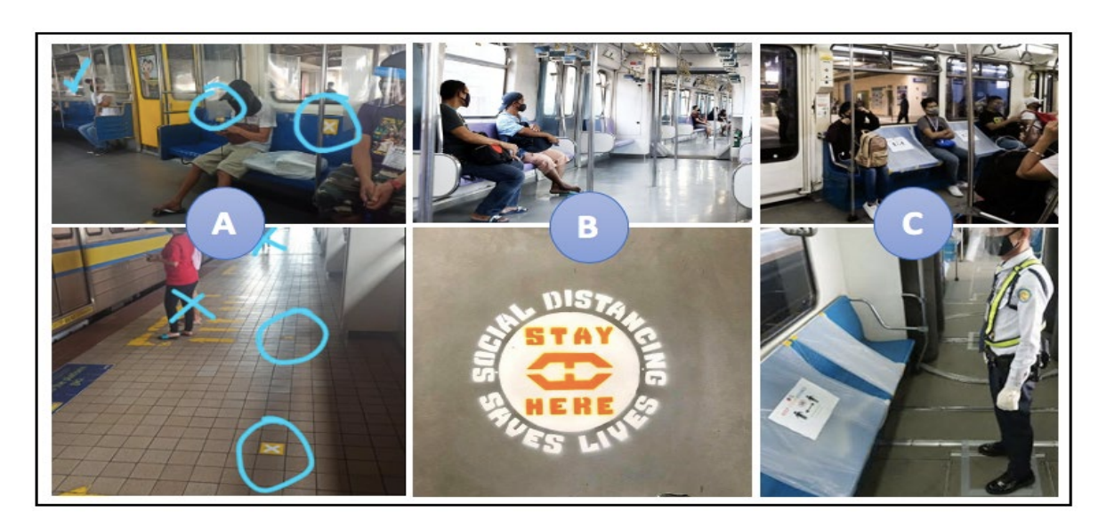
FIGURE 3 VISUAL CUES IN DIFFERENT MAJOR TRAIN SYSTEMS IN METRO MANILA<sup>3</sup>

In Figure 3, it is evident that the three train lines have different approaches in promoting physical distancing. The management of LRT Line 1 and 2 decided to go with a soft-intervention approach, while MRT management decided to employ a more traditional one. The main difference between the two is that the former is more definitive on its target outcome, while the latter is merely suggestive and retains a person's free choice (Baldwin, 2014). Clearly, MRT's approach cannot be considered as a nudge. It is because MRT riders are forced to follow physical distancing protocols by making adjacent seats unavailable to them.