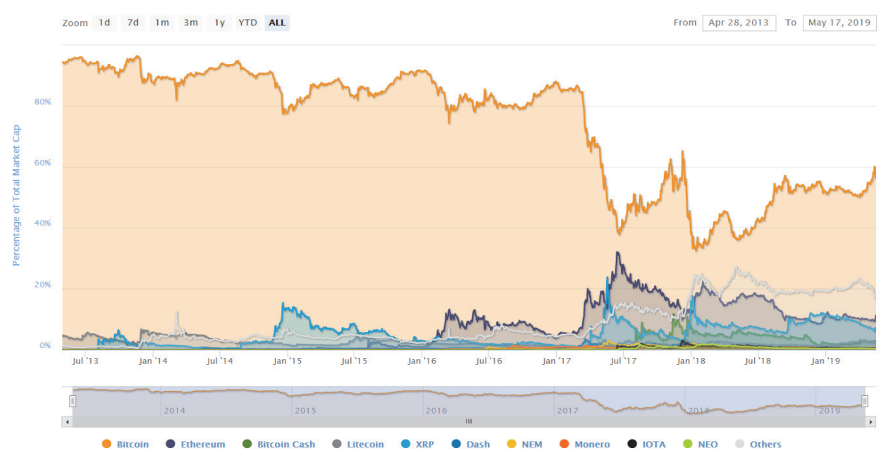
FIGURE 1 PERCENTAGE OF TOTAL MARKET CAPITALIZATION (DOMINANCE)