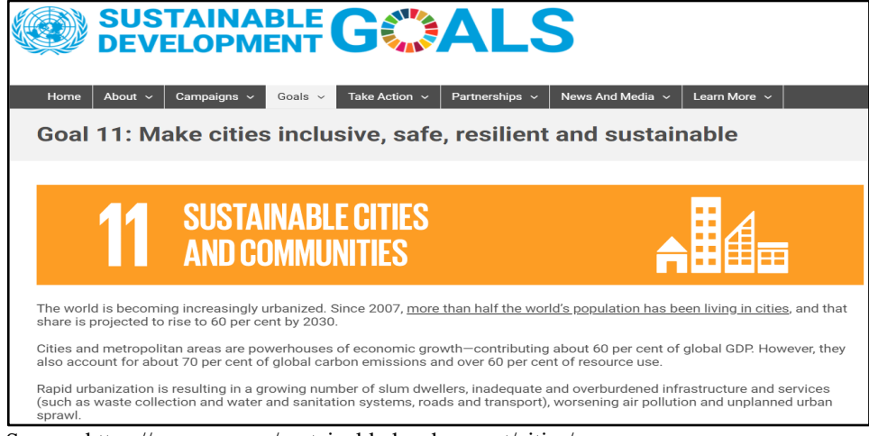
FIGURE 1 UN SUSTAINABLE DEVELOPMENT GOAL 11