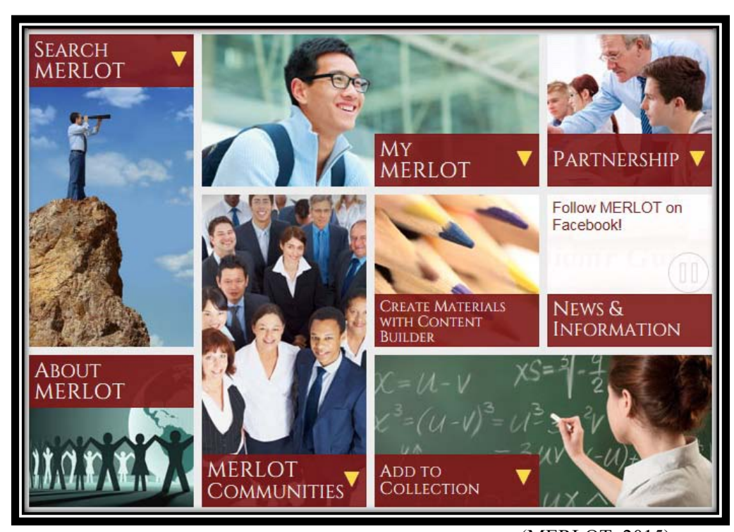
TABLE 2 MERLOT II HOME PAGE

Since its inaugural debut in 2000, MERLOT has incorporated many new features to provided added benefits to users of its system. A few of the more notable enhancements include: improving the search features, bookmarking materials in a personal collections, creating ePortfolios, hosting content, sponsoring an online journal, and providing networking opportunities. Table 2 illustrates the MERLOT II homepage (MERLOT, 2015) that contains eight tiles from which various aspects of the collection can be