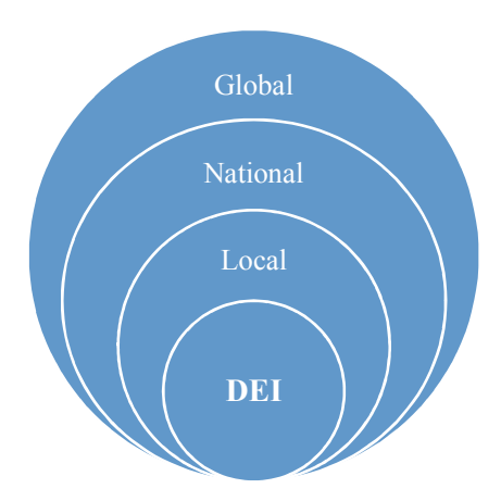
FIGURE 2 EXPECTED CONTEXT FOR DEI IN HIGHER EDUCATION

HEIs have a mission to respond to the needs of the communities they are involved in, both in local and global contexts through responsive, engaged scholarship with a specific focus on the intersectionality of teaching, research, and service. This intersectionality is a multidimensional process where teaching, research, and service activities are aligned to respond to the complex challenges of globalization and an increasingly multicultural world (Knight, 2004; Adams & Paige 2005; Hudzik, 2011). Altbach (1998), Biddle (2002), and de Witt, (2002) stated, "internationalization covers a wide range of services, from study abroad and greater recruitment of international students, to distance education and combinations of partnerships abroad, internationalized curriculum, research and scholarly collaboration, and extracurricular programs to include an international and intercultural dimension (as cited in, Stromquist, 2007, p. 82). Qiang (2003) further confirmed that "Internationalization is not merely an aim itself, but an important resource in the development of higher education towards, first of all, a system in line with international standards; secondly, one open and responsive to its global environment" (p. 250).