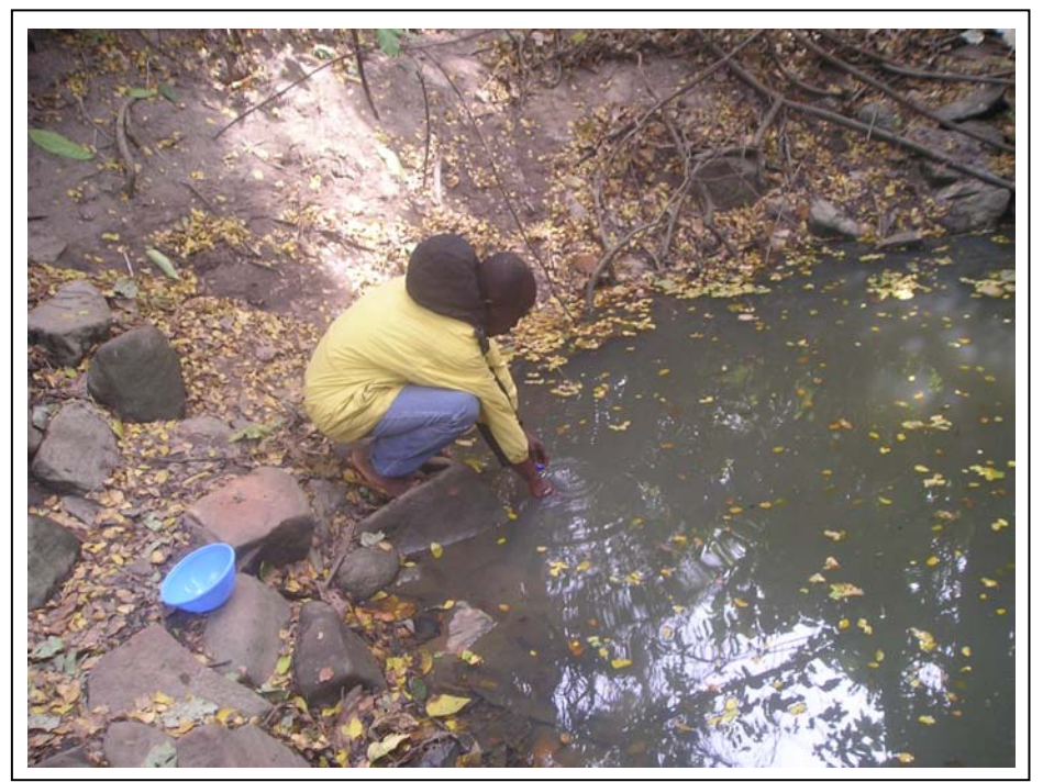
FIGURE 2 SURFACE WATER PROTECTION