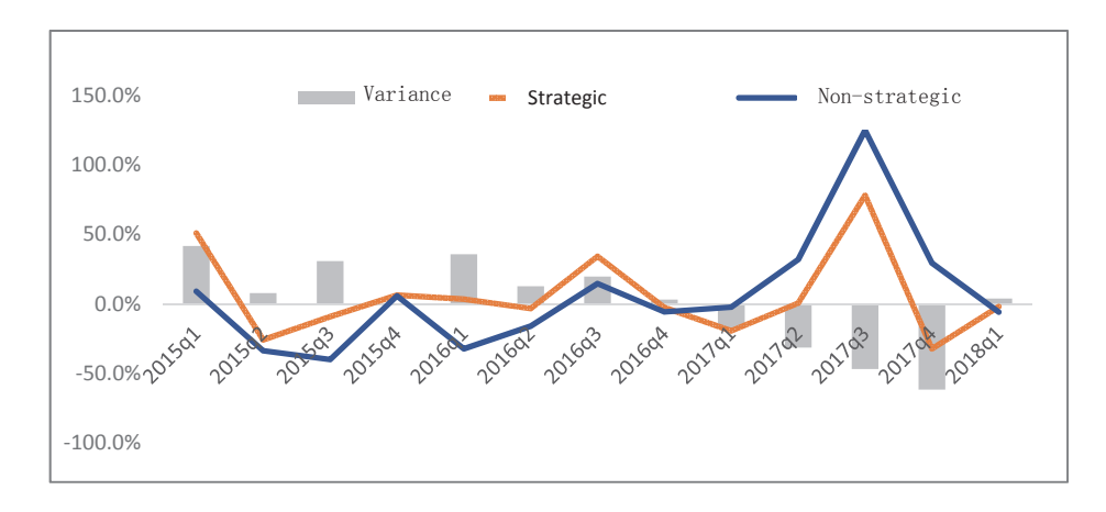
FIGURE 1 COMPARISON OF TAX BURDEN BETWEEN STRATEGIC EMERGING ENTERPRISES AND NON-STRATEGIC EMERGING ENTERPRISES